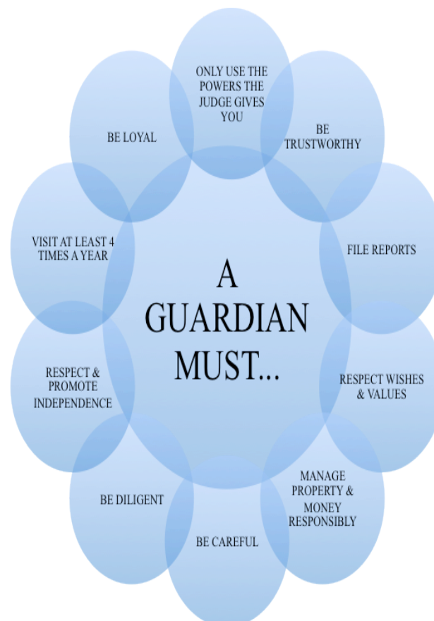
Diagram Of The Powers, Tasks, And Ethical Responsibilities Of A Guardian