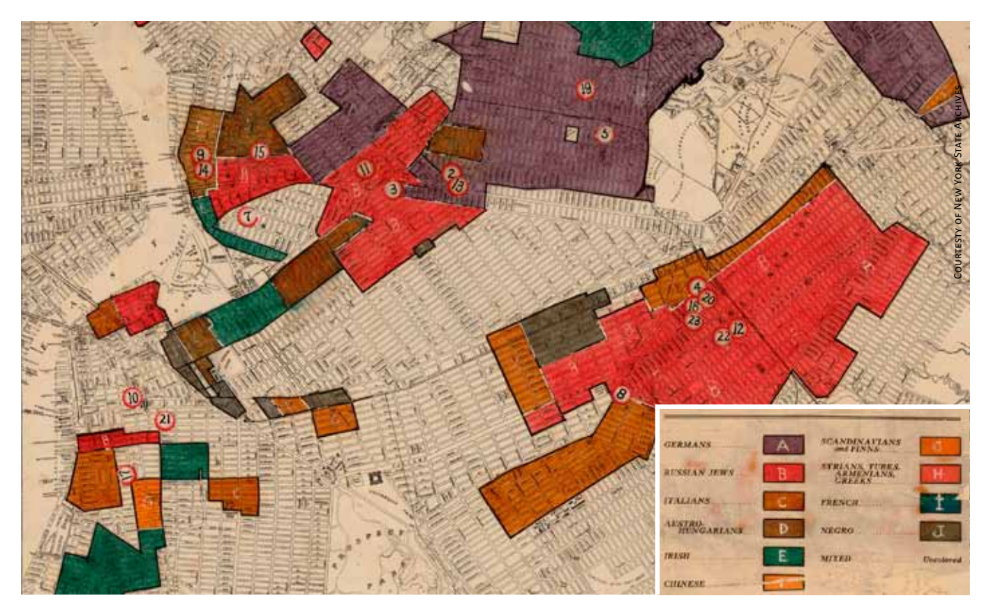
A history of NYPD mapping: In 1919, the NYPD and State Police created "ethnic maps" of New York City, identifying neighborhoods in which certain immigrants groups and their offspring predominated, with the aim to investigate socialists, communists or anarchists.

BOSS notoriously focused its investigations on dissident groups and individuals, including the NAACP, the American Civil Liberties Union, the Fifth Avenue Peace Parade Committee, and the Lower East Side Mobilization for Peace Action, compiling detailed profiles of organizations and individuals. BOSS informers and undercover agents were required to submit detailed reports including specific information on "future plans, unlawful activities, trouble makers, leaflets, weapons, speakers, and statements."<sup>11</sup>